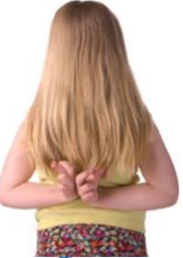
Perception – sounds like truth but it's not...

CONSEQUENCES: READ: 2 Peter 2:4-10 (NKJV) I say – Holy Spirit please lead me back to truth, convince me, convict me, so that I can get to the point where I repent from that way of thinking and come back to truth. READ: 2 Peter 2:11-15 (NKJV). I say – I receive correction and God's truth sets me free. When other people are wrong. It's none of your business and you should rather do what the sons of Noah did when they found Noah drunk. They took a blanket and they walked backwards and covered his nakedness (Pray for them and don't talk about their faults) . READ: 2 Peter 2:16-19 (NKJV). Extract – If you listen to a someone with deception, and all their perceptions, if they defeat you in your truth, then their perceptions become your truth. BE CAREFUL who you get into agreement with, what words you say yes to, what you find yourself in. Be careful. Don't just blabber words out. Extract – Children when you honour your mother and father it will go well with you. Honour is way higher and better than obedience. If you can't obey because the rules are too strict, think about honour. Honour has a lot of rewards and benefits. NOT honouring your parents gets you hurt. Because you open the door to perception and deception to come into your life and then God is going to bring correction. I say – I honour my father and mother so it may go well with me.