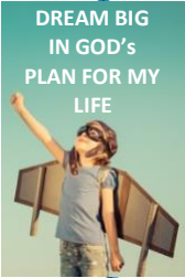
DREAM BIG IN GOD'S PLAN FOR MY LIFE